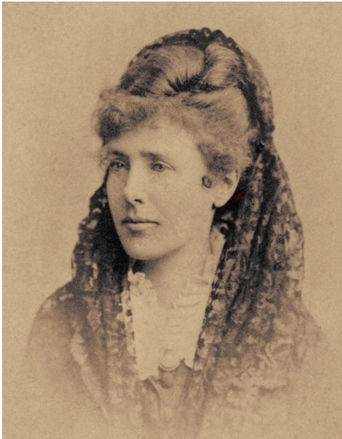
Fig. 1 Kate Field.

artefacts, bequeathed to the Smithsonian Institution's National Museum of Natural History in Washington, DC, as the 'Schliemann collection' (accession number 27023), 14 and seeks to set the story in historiographic context.