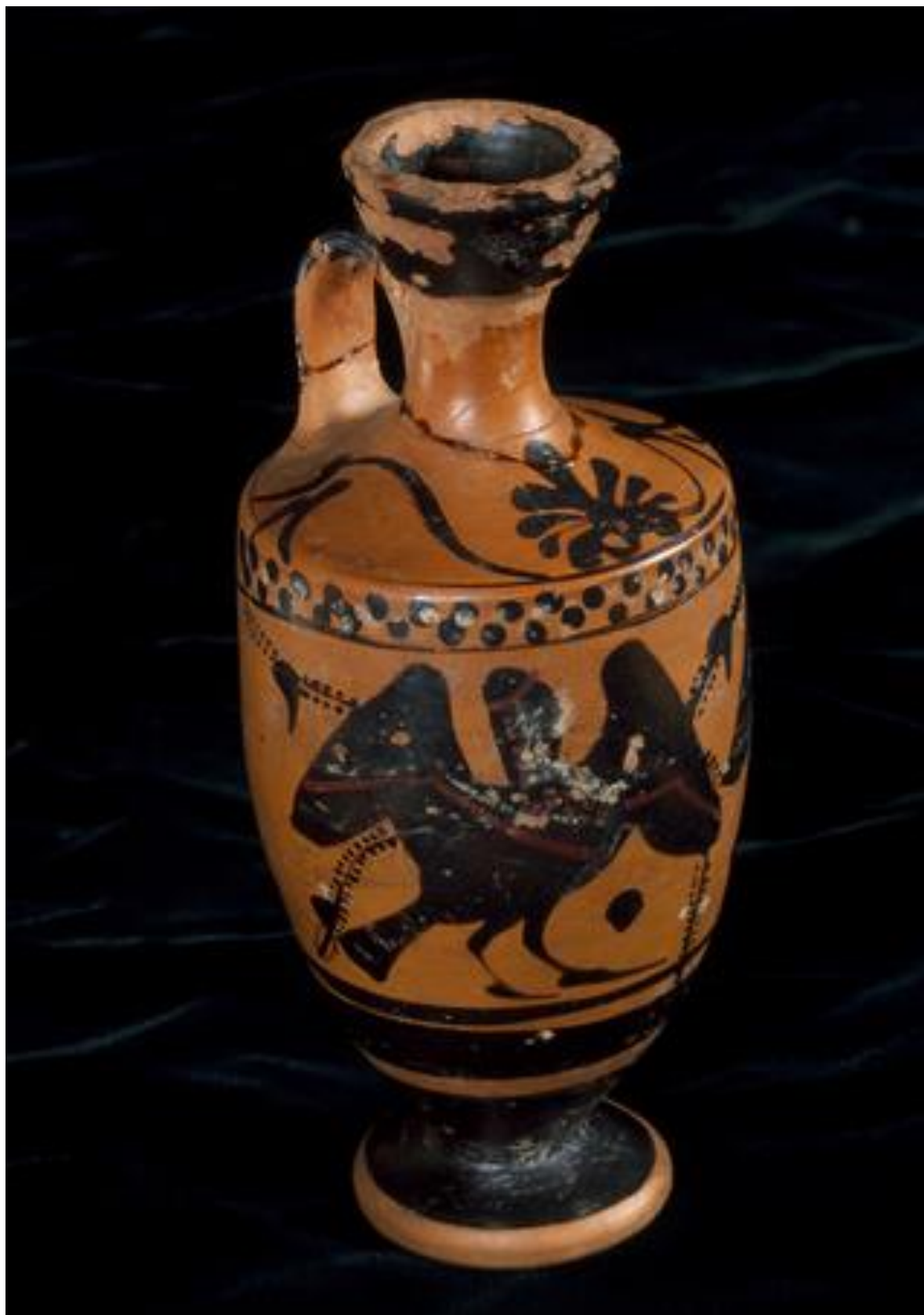
Fig. 5 'Athenian' lekythos with two black sirens, 6 th century BC. Photo: © Museum of Cultural History, University of Oslo, inv. C41797.