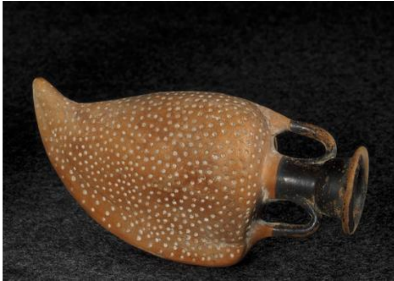
Fig. 9 Two-handled vase in the shape of an almond. From Thebes. Photo: © Museum of Cultural History, University of Oslo, inv. no. C41789.