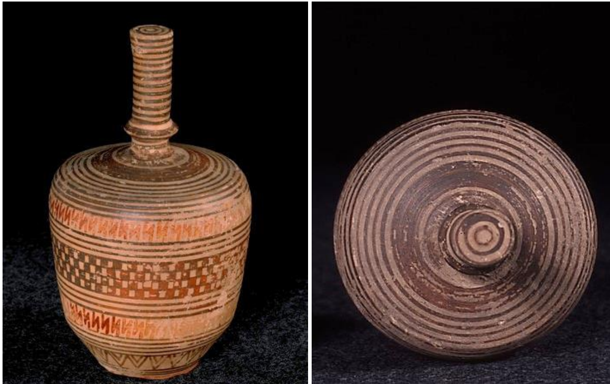
Fig. 12a-b Vase without opening. From Corinth, 7 th century BC. Photo: © Museum of Cultural History, University of Oslo, inv. no. C41799.

the sacrifice, or officiates, or – most probably – combines both functions. He and the bull seem to be the only males present; the musician is female, as are the two figures who make up the procession. The painter was a master of the craft, and could deserve one of those made-up names by which decorators are known to archaeologists – ‘Oslo Painter’ would be apt, and has in fact been used at a time when it was thought that other works by the same hand could be identified. 20 ‘Names’ are not usually given to authors of singletons.