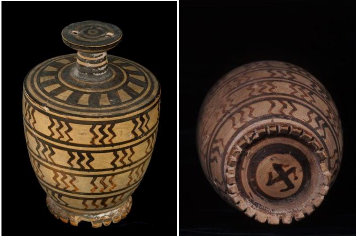
Fig. 13a-b Vase without opening. From Corinth, 7 th century BC. Photo: © Museum of Cultural History, University of Oslo, inv. no. C41803.

solace in eating poppy-seeds while searching for her lost daughter. The pomegranate is another fruit with such associations, and pomegranate-models are common, but poppy-heads are rare.