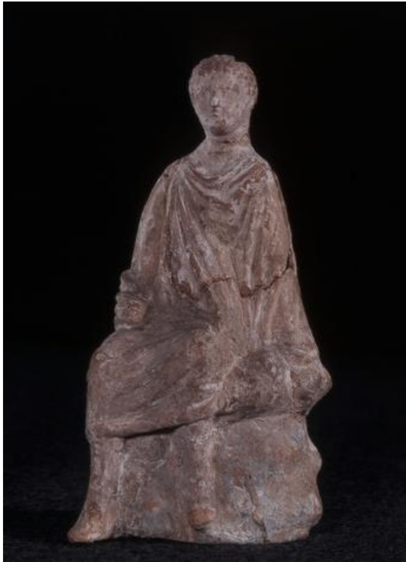
Fig. 2 Tanagra figurine. inv. no. C41776.

and deciphering the Odyssey scene, but no more than one who also had a working knowledge of ancient pottery – Ingvald M. Undset (1853-1893), the noted prehistorian. 5 It is probably not a coincidence that the very next entry in the accessions list is ‘a terracotta figure from Tanagra representing a woman in ample folded drapery, seated on a rock painted in pink colour, hair reddish-brown, bought from Dr Ingvald Undset’ (Fig. 2, C41776). Even he could hardly have known the provenances of the objects. Provenance is polysemic: in contemporary Classical Archaeology the usual and recommended sense is ‘the earliest attested presence in modern times’ – a find-spot, or, e.g. a collection. Often, especially in the past, it has meant a supposed place of ‘origin’, or even a