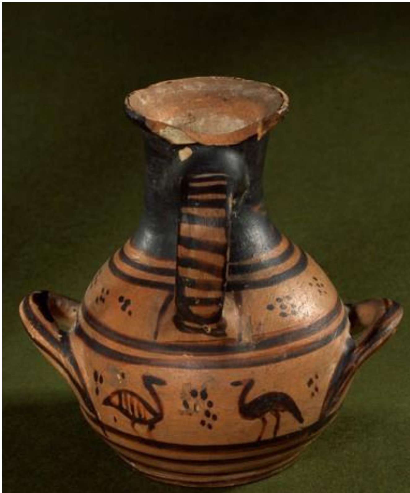
Fig. 4 Three-handled vase (miniature hydria). From Athens, 'pre-Homeric'. Photo: © Museum of Cultural History, University of Oslo, inv. no. C41760.