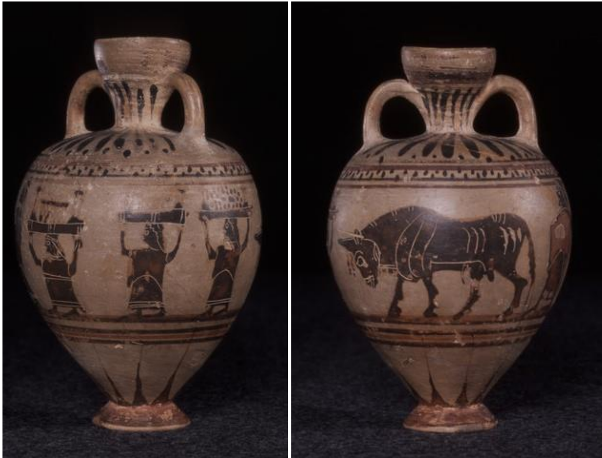
Fig. 11a-b Corinthian amphoriskos. 6 th century BC.