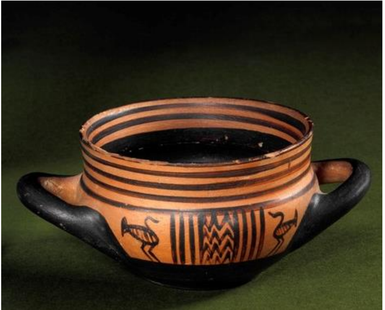
Fig. 3 Vase with two handles and open mouth. From Athens, 'pre-Homeric'. inv. no. C41761.

One thinks of an oddity in Geometric art: miniature jugs placed on top of full-size ones, as an extra mouth. An Oslo collection, the Museum of Applied Art, has a good example. The context is dated variously in the publication, but could constitute an early Geometric tomb-group. 9 Mrs A. D. Ure pointed out the resemblance in vase-paintings from Eretria in Euboea, and she was probably right. Eretria exported her wares widely, to Olbia in the North and Sicily in the West, and there are many finds from Euboea itself and from Boeotia. Her atticizing pots may have sold less well in Attica, except possibly in outlying communities near to the place of manufacture. The 'Athenian' lekythos with two sirens has features that are rare on comparable Attic vases: minimal use of incision, here for eyes and mouth only, and long curving bands of white alternating with purple (Fig. 5, C41797). 10