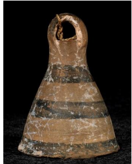
Fig. 10 Bell. From Thebes, Boeotia. Photo: © Museum of Cultural History, University of Oslo, inv. no. C41788.

Finally, the terracotta bell from Thebes, previously unpublished, measures 50 mm in width at the base and 64 mm in height, with a loop at the top where the clapper was suspended through a hole; three transverse dark bands are the only decoration (Fig. 10, C41788). Thebes has yielded many such objects, some from the tomb of the men of Thespiiai who fell in the battle of Delion in 425 BC. What were they for? Toys or magic have been suggested, but clay bells with clay or wooden clappers could not make the kind of noise enjoyed by children, and would leave spirits unimpressed. Probably, as has also been suggested, these are cheap miniature images of metal bells for some funeral use – a usage comparable to the manufacture of miniature pots for dedication.