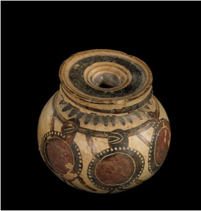
Fig. 6 Aryballos with three hoplites. From Tanagra, 6 th century BC. Photo: © Museum of Cultural History, University of Oslo, inv. no. C41804.