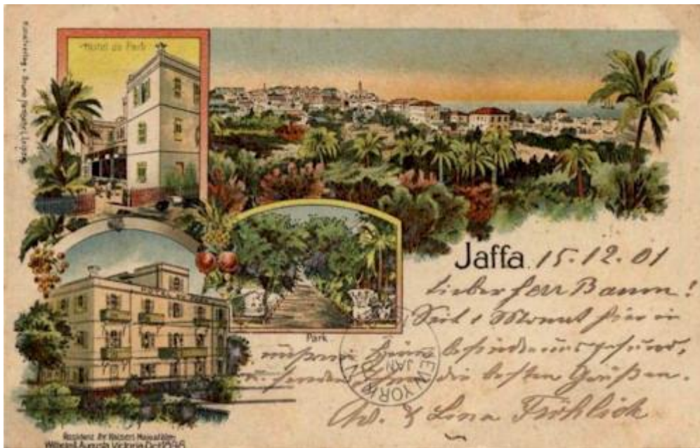
Fig. 5 Postcard from 15.12.01 depicting Hôtel du Parc with the surrounding gardens.

the zoo wandering the botanical garden, in conversation with the novel's main character Dr Rechnitz: