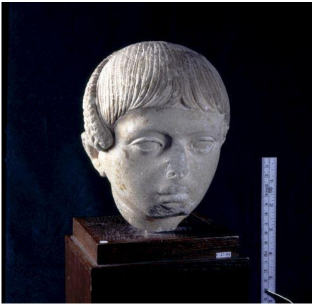
Fig. 6b Marble portrait of a boy. AD 120-130. From the Ustinow Collection. Inv. C42184.