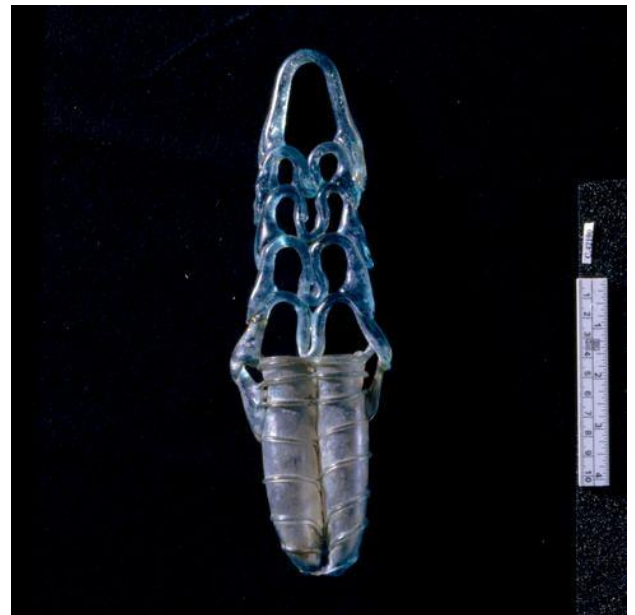
Fig. 6c A double balsamarium. From the Ustinow Collection. Inv. C42190.