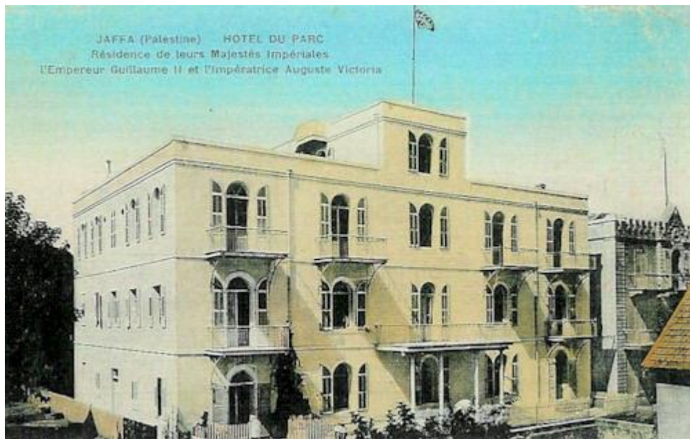
Fig. 3 Postcard depicting Hôtel du Parc in 1898.

In practice, enforcement of this law was impossible. The Ottoman Empire was so vast that its government did not have enough officials to oversee and implement these regulations. To complicate matters further, the Ottoman government also deployed artefacts as cultural capital in the form of bribes and gifts to forge political alliances and cultivate diplomatic relationships. This was the case with the close association between Sultan Abdulhamid II, Emperor Franz Joseph I and Kaiser Wilhelm II. The Sultan himself ignored the law when it suited his diplomatic goals, allowing the free movement of archaeological objects in return for political gain from influential Westerners. 29 The Kaiser visited Ustinow's collection of antiquities in 1898 while lodging at Hôtel du Parc during a royal visit to Palestine. This kind of encounter might explain how Ustinow was allowed to collect and display ancient artefacts (Fig. 3). 30