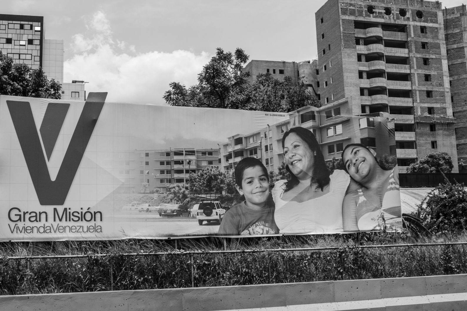
Socialist housing project for the middle classes of Caracas