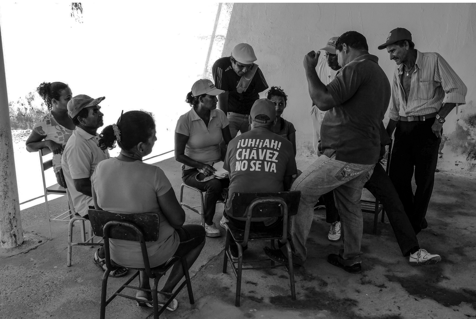
A communal council meets to defend the Bolivarian Revolution during the presidential campaign of Nicolás Maduro