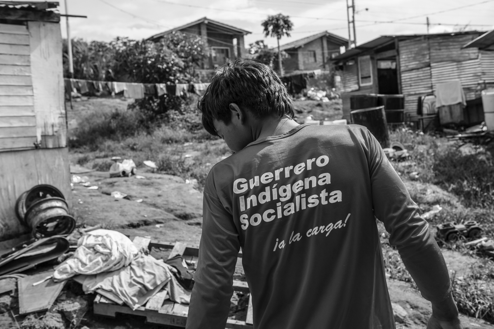
A young man from the Warao ethnic group in a peripheral community, his shirt says 'Indigenous socialist warrior to the attack'