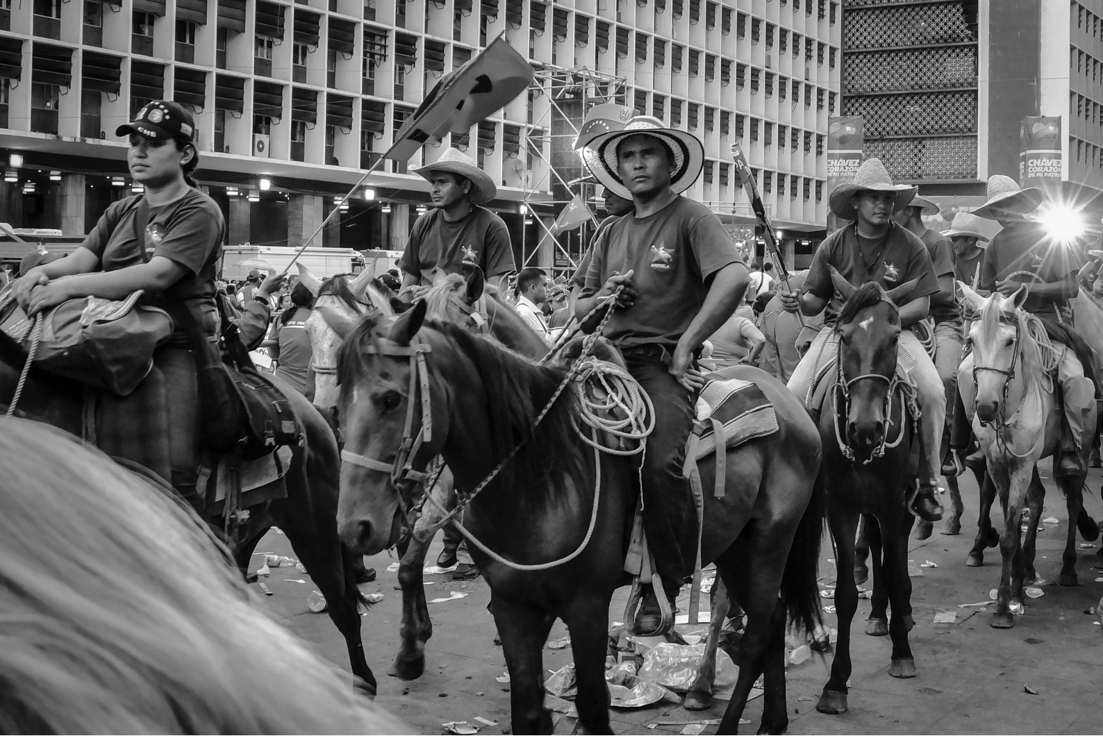
Entry of Bolivarian peasants to Caracas