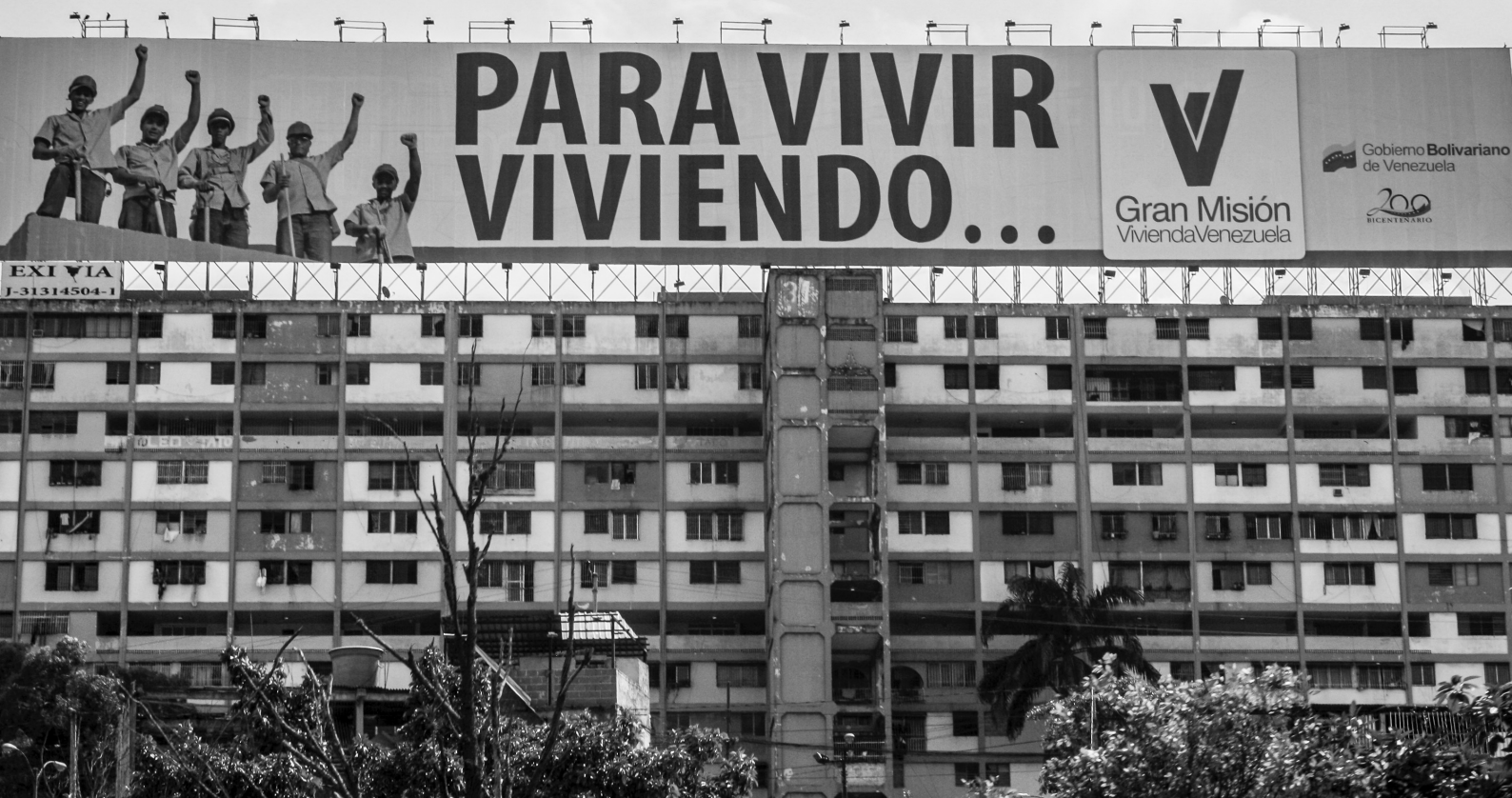
A worker banner celebrating the socialist housing plans promoted by the Bolivarian Revolution