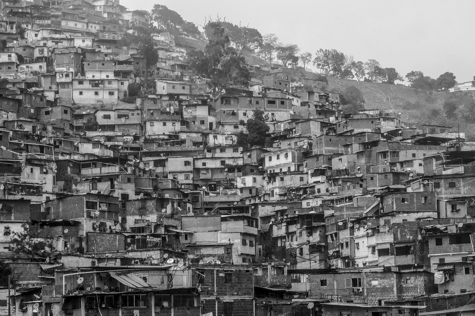
Poor neighborhoods in the mountains of Caracas