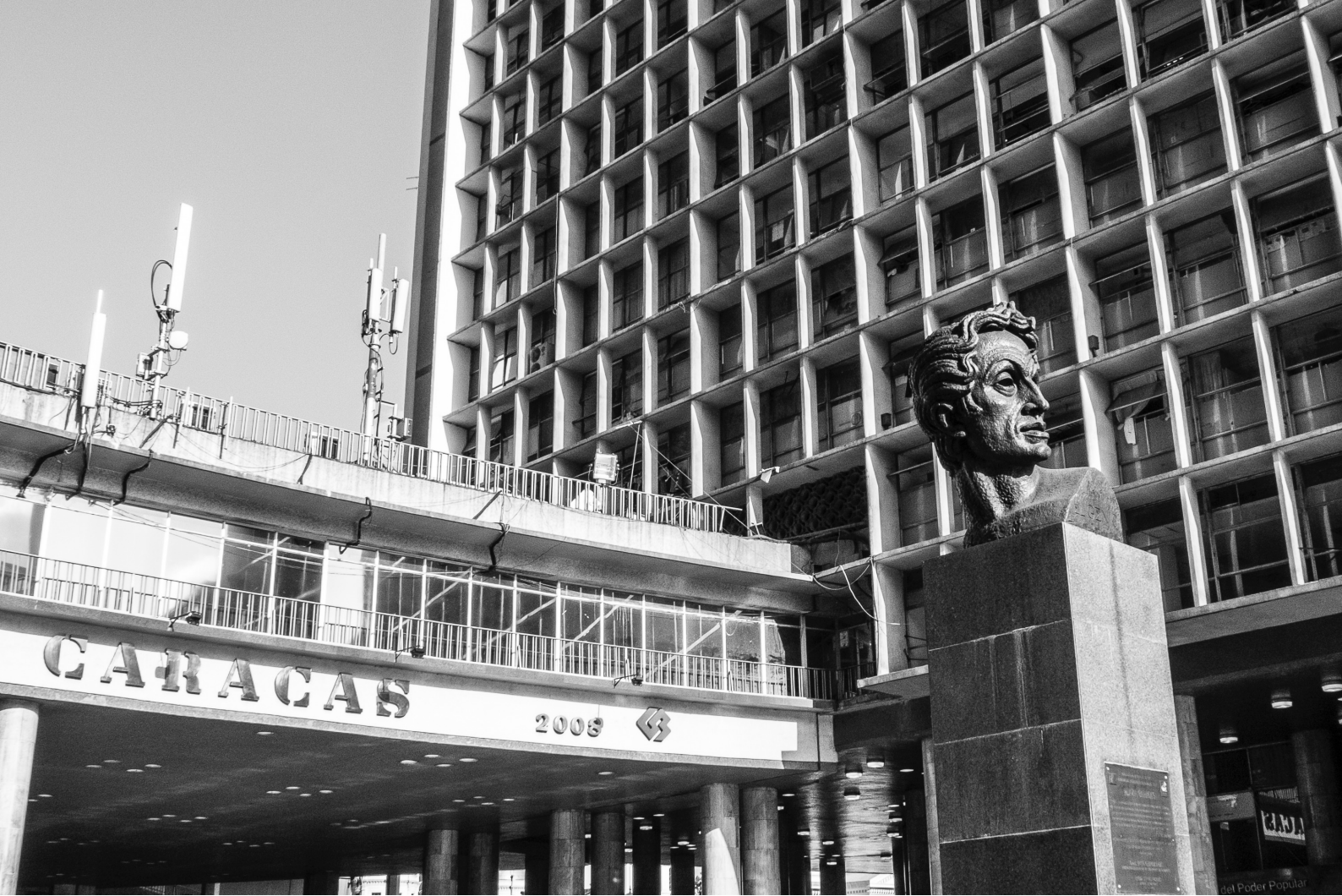
The renovated Plaza Caracas with the bust of Simón Bolívar, the sustenance of the Bolivarian Revolution