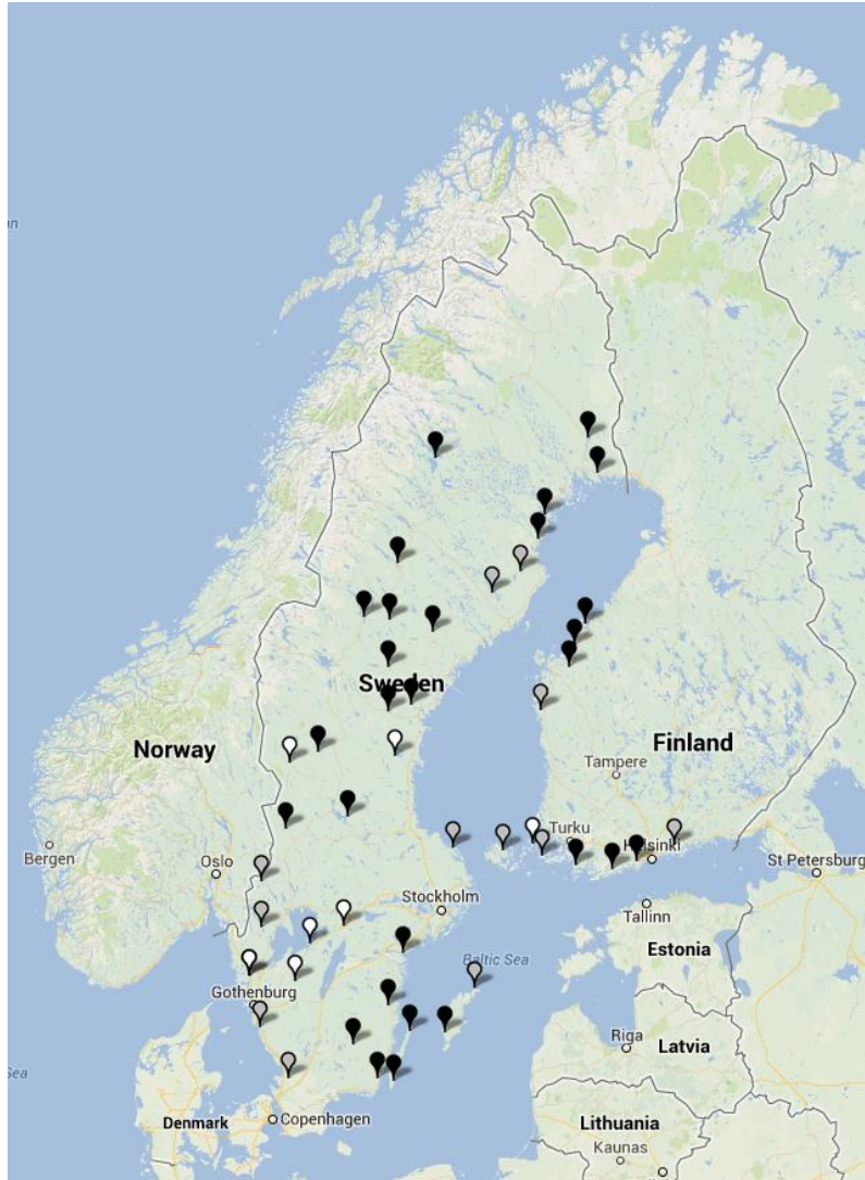
Map 2: Acceptance of the NPI tag

(#1436: Moster Lisa har nog inte kommit än nå. Aunt Lisa probably hasn't arrived yet. )