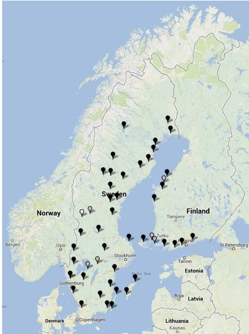
Map 1: Acceptance of affirmative sentence tags.

(#1435: Pappa kan hämta dig vid stationen kan han nog. 'Daddy can pick you up at the station, he probably can.' )