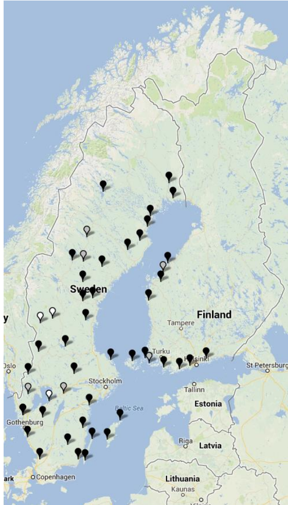
Map 3: Affirmative sentence tag, older informants

It seems that at least the affirmative sentence tag is more often accepted by the older informants than by the younger speakers. This is shown in Map 3 and Map 4 below.