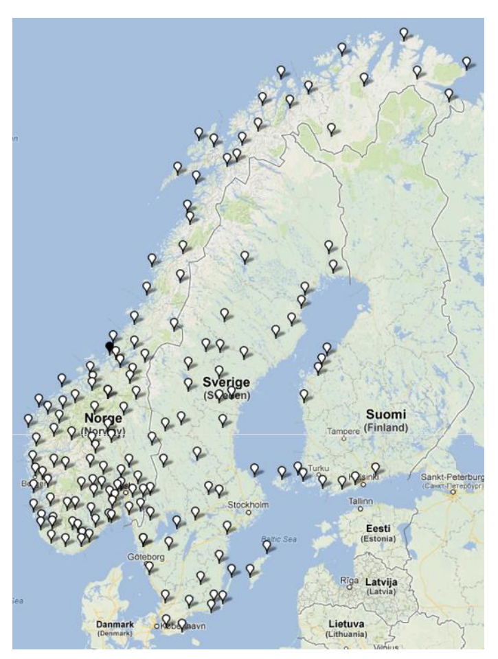
Map 1: Quasi-argumental det 'it' with a weather-verb