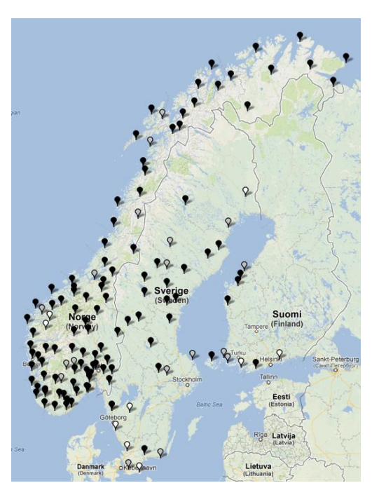
Map 6: Expletive her/här 'there' in a presentational sentence with an unaccusative verb (#970), older speakers.