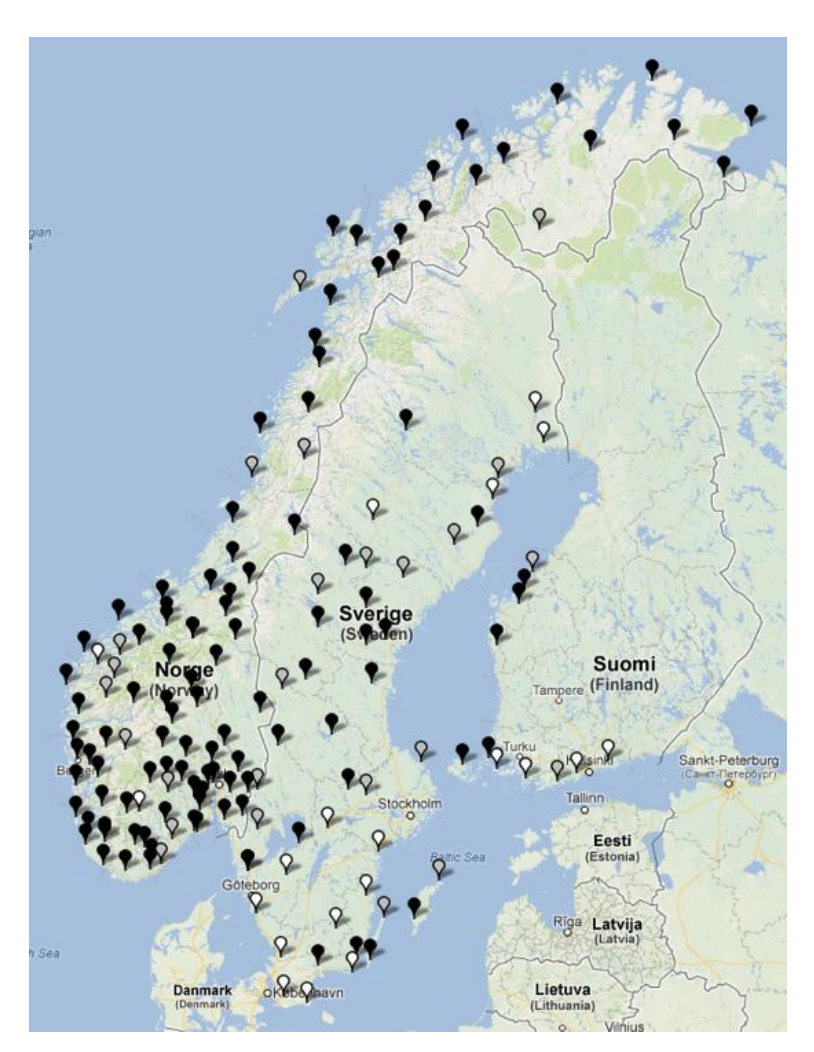
Map 5: Expletive her/här 'there' in a presentational sentence with an unaccusative verb (#970: Men då kom her inn ein svær hund. 'But then a big dog came in'). (White = high score, grey = medium score, black = low score).

All three subject forms are accepted in weather-sentences in locations in Southwestern Finland. In presentational sentences, all three subject forms are acceptable in several locations, particularly in Southern and Southwestern Sweden.