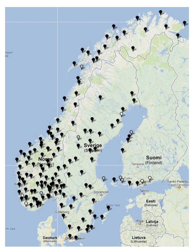
Map 2: Quasi-argumental der/där 'there' with a weather-verb (#966: Der snør. 'It snows').

(White = high score, grey = medium score, black = low score).