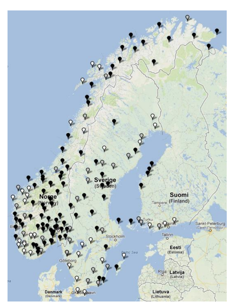
Map 3: Expletive der/där 'there' in a presentational sentence with an unaccusative verb (#969: Men då kom der inn ein svær hund. 'But then a big dog came in'). (White = high score, grey = medium score, black = low score).