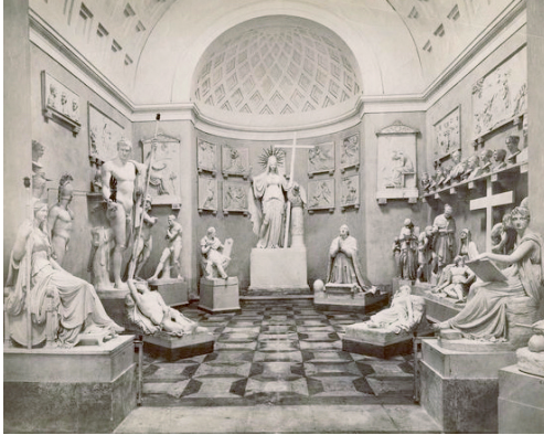
Fig. 5. Gipsoteca Canoviana , postcard ca. 1920 (© private collection).

Designed from the outset to be open to the public, Sartori produced a visitors' guide in 1837 – the booklet Gypsotheca Canoviana eretta in Possagno . In its forty-seven pages, the text presents a list of 195 objects on display for visitors to admire (Sartori Canova 1837). With no introductory or explanatory text, the booklet constitutes a simple inventory of the collection, but is however organised according to the spatial order in which the works are distributed across two “sections” of the Gallery. The descriptions, which are generally fairly rudimentary, take the form of captions, sometimes with a few notes on how the work was produced or commissioned.