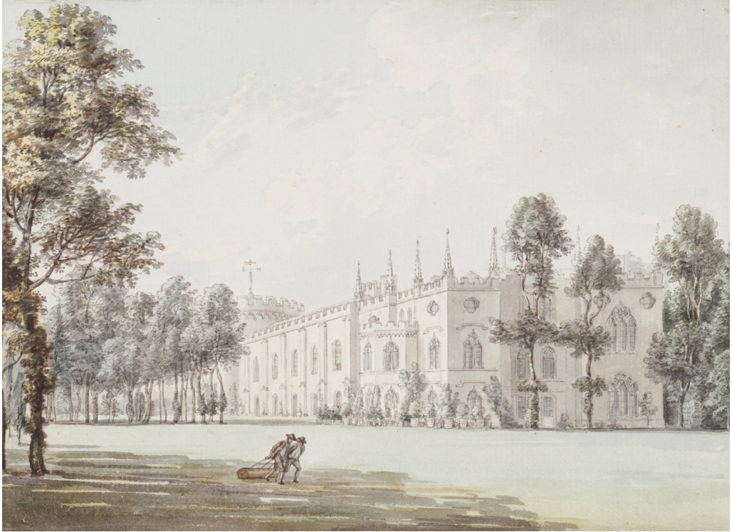
Fig. 1. Paul Sandby, Strawberry Hill House , ca. 1769, watercolour, 39,2 x 75,7 cm, Lewis Walpole Library, Yale University (© public domain).

from dispersal or even destruction. 8 The text thus in fact became a catalogue raisonnée of a private collection conceived with museum-like purposes in mind, driven by the owner's/curator's desire to not only collect but also to preserve and present specific categories of objects to the general audience. Yet, irrespective of the author's declared objectives, the Description essentially constitutes a systematic guide for visitors to Walpole's villa, and its value lies above all in the basic information it provides about the museal arrangement devised and created by Walpole and presented to his guests. These detailed indications in fact proved invaluable in the recent restoration of