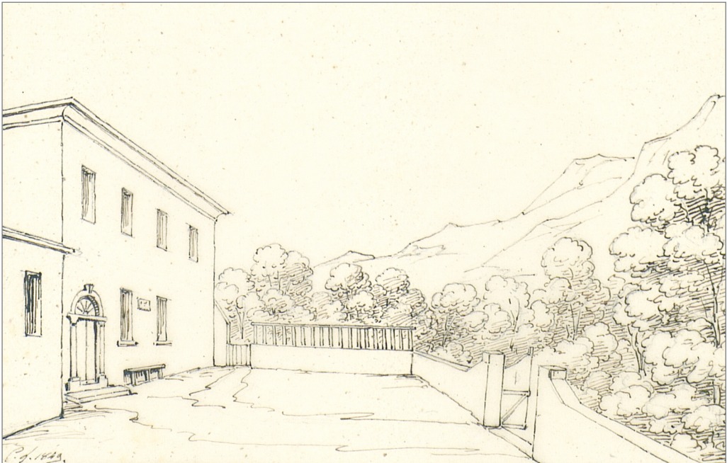
Fig. 4. Pierre Lacour fils, Les Charmettes , 1825. In Id. , Voyage à Rome fait en 1824 et 1825 , ms. Bibliothèque Municipale de Bordeaux, vol 1, c. 69 (© public domain).

We estimated that the many travellers that visit this secluded spot would welcome some precise instructions to help them recognise the elements they have come to see more easily, and bring them