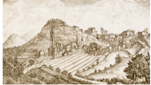
Fig. 3. Francesco Bellucco, Panoramic view of Arquà with Petrarch's house indicated by an asterisk , in Zaborra 1797 (© private collection).

The focus on the places and objects connected with Petrarch's memory is also enhanced by the decision to include a set of six engravings dedicated to the house and its furniture, which is presented as authentic, the poet's tomb and a fountain named after him, as well as a panoramic view of the place where the poet's residence is clearly indicated (fig. 3) and an image of the lake near the hamlet. 15 Despite